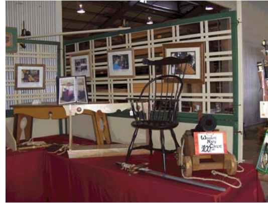
Humboldt Woodworking Society Booth at WoodFair 2008